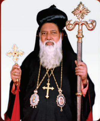
MORAN MOR CYRIL BASELIOS CATHOLICOS