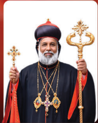
H.E. CARDINAL BASELIOS CLEEMIS CATHOLICOS