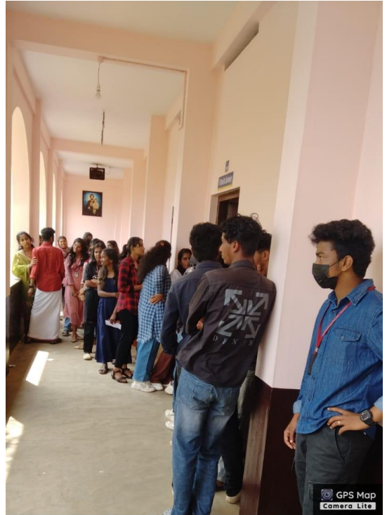
Pazhassi Raja College Bus Stop, Shed-Pazhazziraja College-Pulpally Rd, Cheppila, Pulpally, Kerala 673579, India

Latitude 11.78778366° Longitude 76.17833608° Local 10:55:28 AM Altitude 720.88 meters GMT 05:25:28 AM Tuesday, 08-11-2022