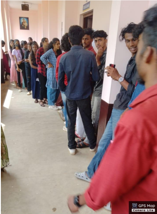
Pazhassi Raja College Bus Stop, Shed-Pazhazziraja College-Pulpally Rd, Cheppila, Pulpally, Kerala 673579, India

Latitude 11.78778366° Longitude 76.17833608° Local 10:55:28 AM Altitude 720.88 meters GMT 05:25:28 AM Tuesday, 08-11-2022