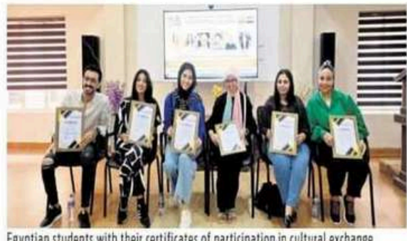
Egyptian students with their certificates of participation in cultural exchange programme