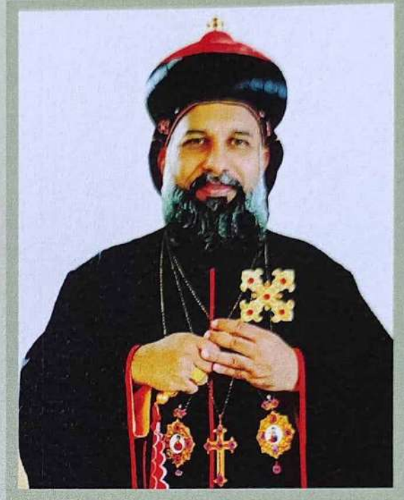
MORAN MOR CYRIL BASELIOS CATHOLICOS