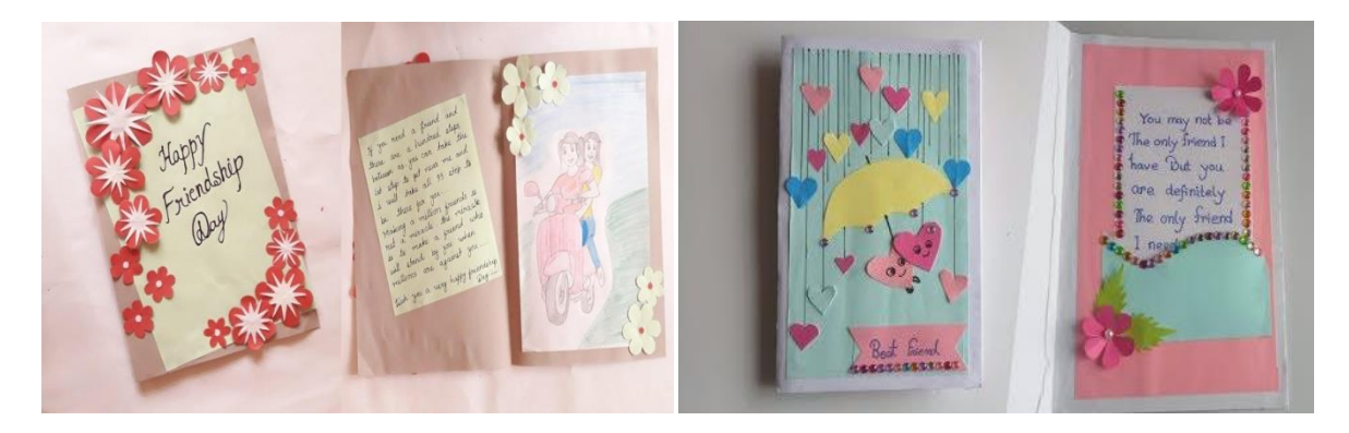
Different competitions of friendship card making and treasure hunt were conducted. Fascinating friendship quotes were fixed in the campus which received wide appreciation. Sixty students from various departments participated in the competitions. Department of Microbiology and Mass Communication bagged first and second places respectively.