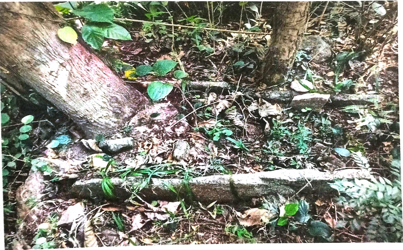
Megalithic Site before Excavation

The term 'megalith' ( mega : huge lith : stone) is used to describe the use of large stone blocks in the construction of Dolmen. A Dolmen is usually made of granite slabs arranged above the ground in a square or rectangular shape with a capstone. This rectangular Dolmen is one of the five Dolmens situated in a private land in Mullankolly Grama Panchayath, Wayanad District in Kerala. The excavated stone chamber has 240 cms. length and 80 cms. width. The depth of this monument is 170 cms. This structure is constructed in the East-West direction. At present this stone chamber has three huge granite blocks only. The capstone and one side stone slabs of west direction have lost in the ravages of time. The term Dolmen and Dolmenoid cist are sometimes used interchangeably because it is difficult to identify whether the partial burial or exposure of a monument was intentional